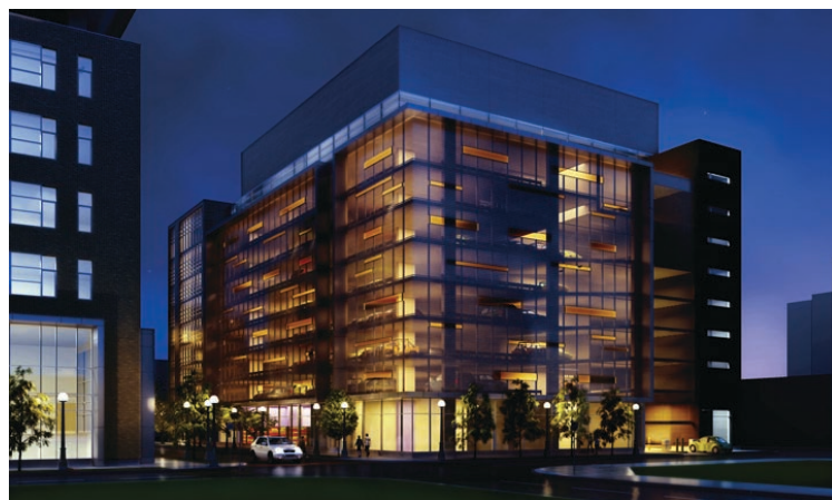
Parking and Utilities Building at night