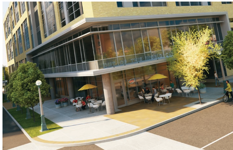
CAMH Gateway Building, featuring Out of this World Café

Green is the colour. A new Parking and Utilities Building considerably reduces CAMH's environmental footprint by centralizing natural-gas heating and cooling for all of CAMH's new facilities and eliminating most surface parking. In fact it's one of several ways this redevelopment is 'green' ( see below ).