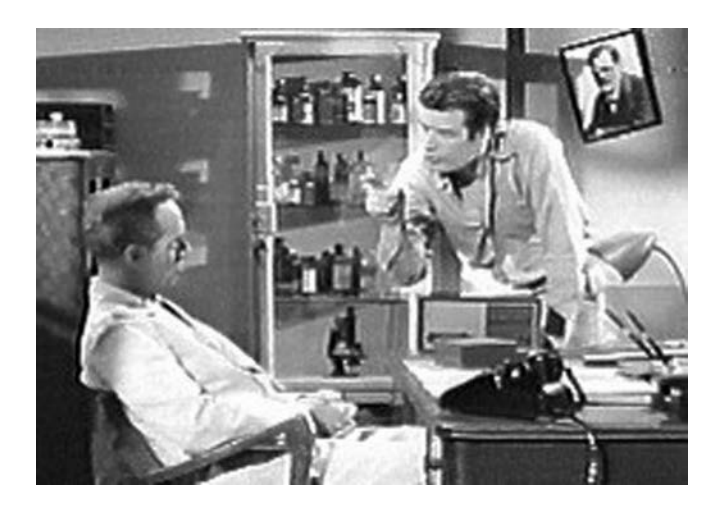
"Shock Corridor" (1963), co-sponsored by the Friends of the CAMH Archives for the Rendezvous with Madness Film Festival, 2005.