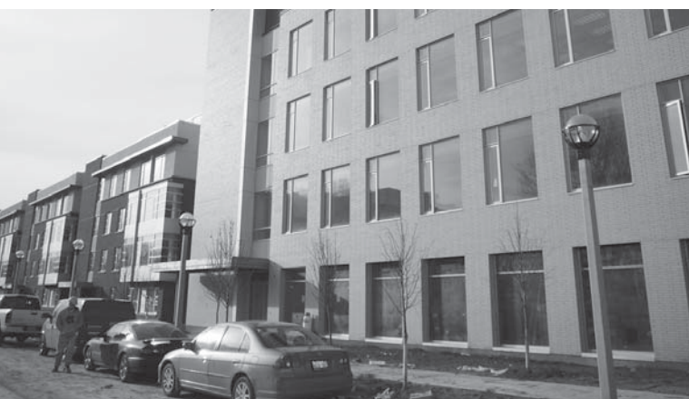
The first four buildings of Transforming Lives Here, the CAMH redevelopment project, are nearly complete and will open in April 2008. The buildings feature ample natural light, a decidedly non-institutional look, and outdoor courtyards. This is the first step in the redevelopment of the 27-acre Queen Street site into a mixed-use urban village, where CAMH's new facilities will sit side-by-side with new shops, cafes, residences and offices.