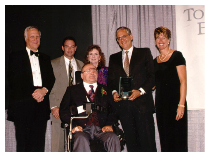
The annual Courage to Come Back Awards were inaugurated in the Clarke Institute's Stokes Auditorium, 1993.