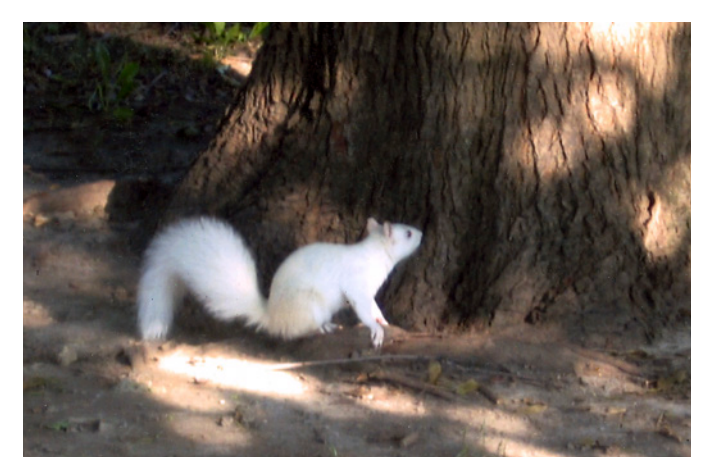
CAMH Archives photo, 2008

"One of the most challenging aspects of mental illness in my experience is that sense of isolation. That feeling that you are going through something that no one else understands. You feel distanced from your community. I want this work of public art to be a touchstone between people – something that facilitates social cohesion and breaks down that sense of isolation."