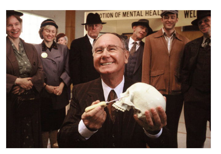
"A Hole in One" at Workman Arts' annual Rendezvous with Madness Film Festival – at the Joseph Workman Auditorium, 2004.