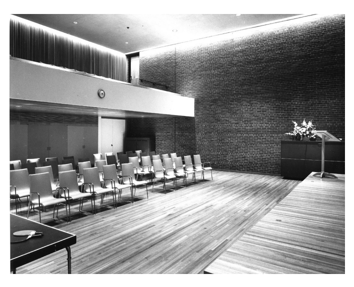
Donwood Institute Auditorium, 1960s - 70s